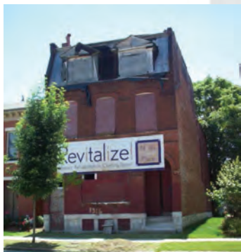
1316 North Market