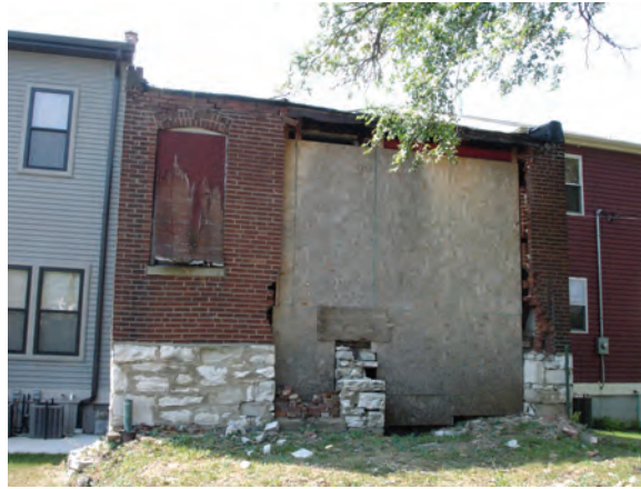
Today (back view)