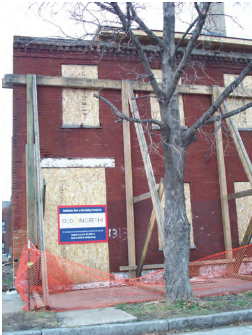
Today (front view)