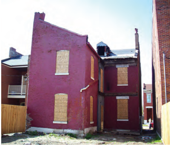
Today (back view)