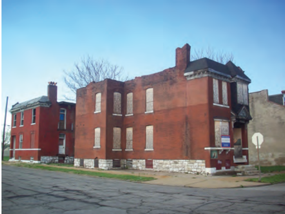
Today (side view)