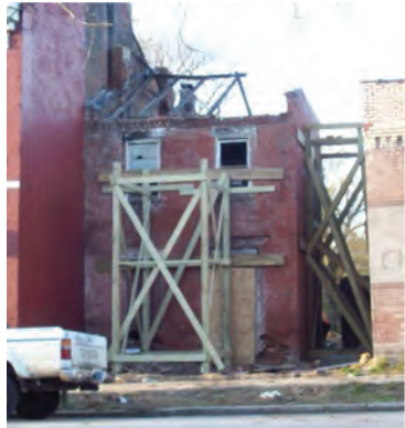
1309 North Market